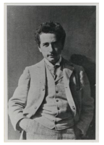
Albert Einstein as a student.